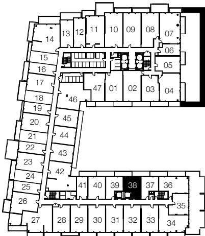
Unit applies to floors 10,11